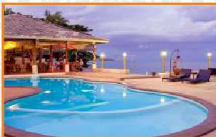
NEW NORDIC SAMUI BEACH HOTEL