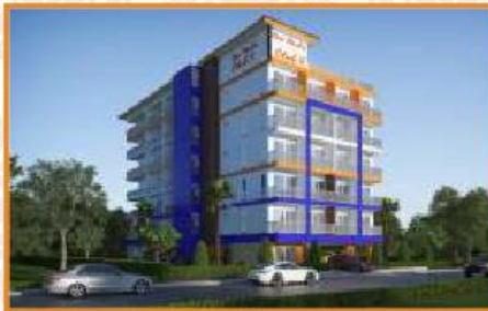
NEW NORDIC CLUB