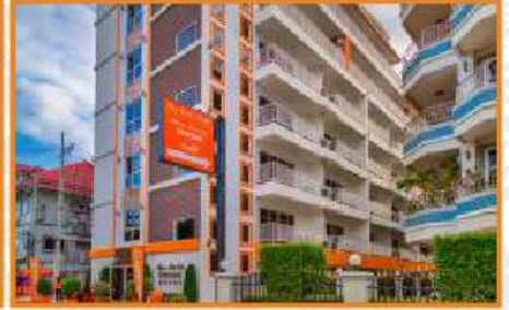
NEW NORDIC KRISTINE