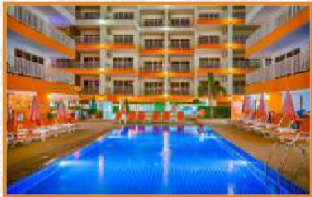
NEW NORDIC HOLIDAY