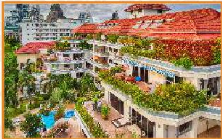
NEW NORDIC RESORTS