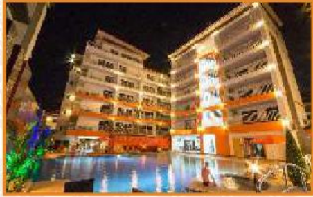
NEW NORDIC FAMILY

New Nordic offers luxurious apartments and rooms surrounded by swimming pools, tropical gardens, park facilities and numerous common areas. This wide range of units combined with New Nordic sale team in Bangkok, Pattaya and Europe, as well as having two travel agencies, gives us a unique position in the market to fill our rooms.