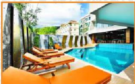
NEW NORDIC RATANA SUITES