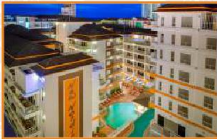
NEW NORDIC ANITA