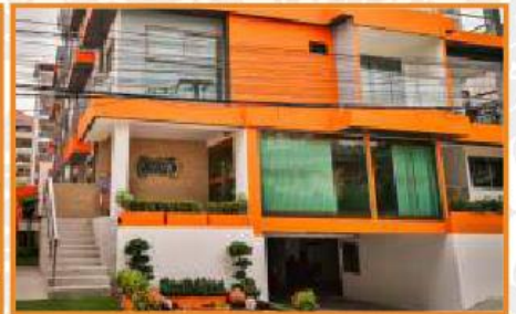
NEW NORDIC C-VIEW