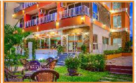
NEW NORDIC TREND