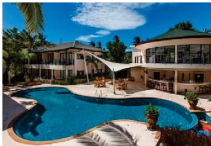
Samui Emerald Condominium Completed in 2012

SET WITHIN LUSH TROPICAL NATURE, SAMUI EMERALD VILLAS IS OUR LATEST LUXURY RESIDENTIAL DEVELOPMENT ON THE PARADISE ISLAND OF KOH SAMUI, THAILAND, FEATURING ONLY 10 EXCLUSIVE DUPLEX POOL VILLAS.