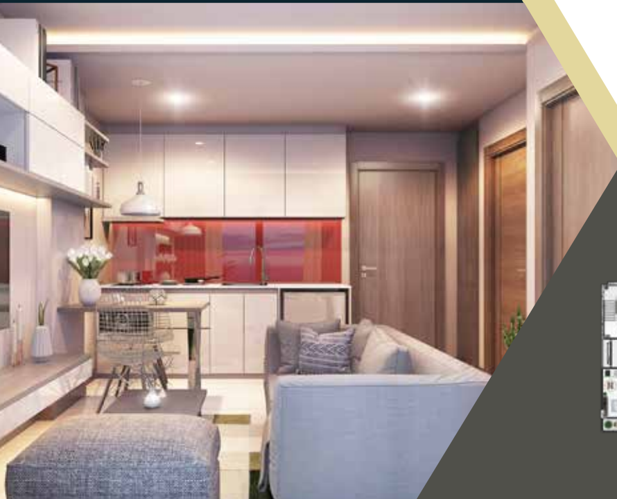
2nd-7th Floor Plan