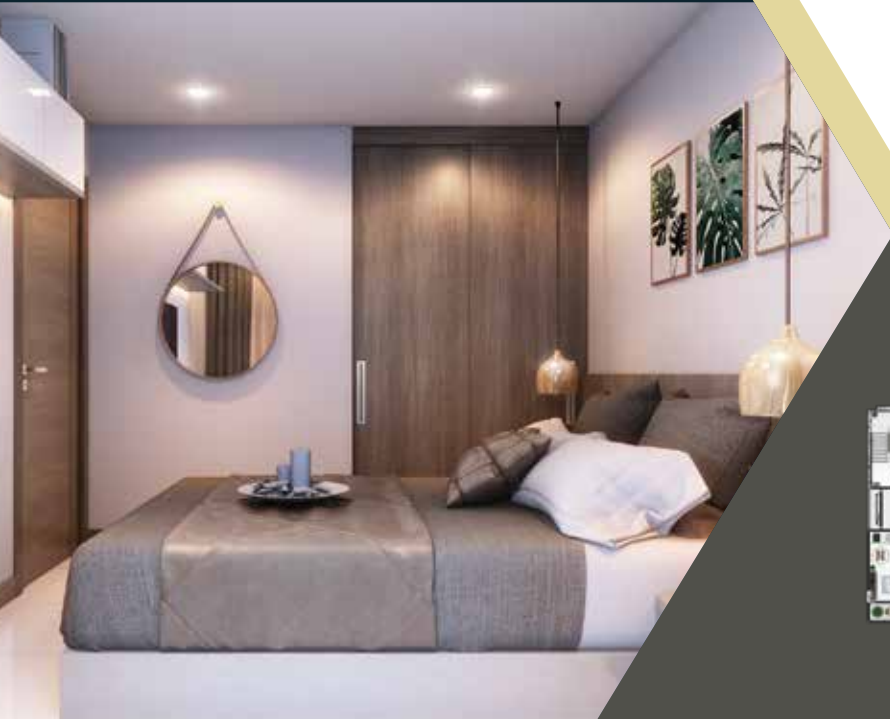
2nd-7th Floor Plan