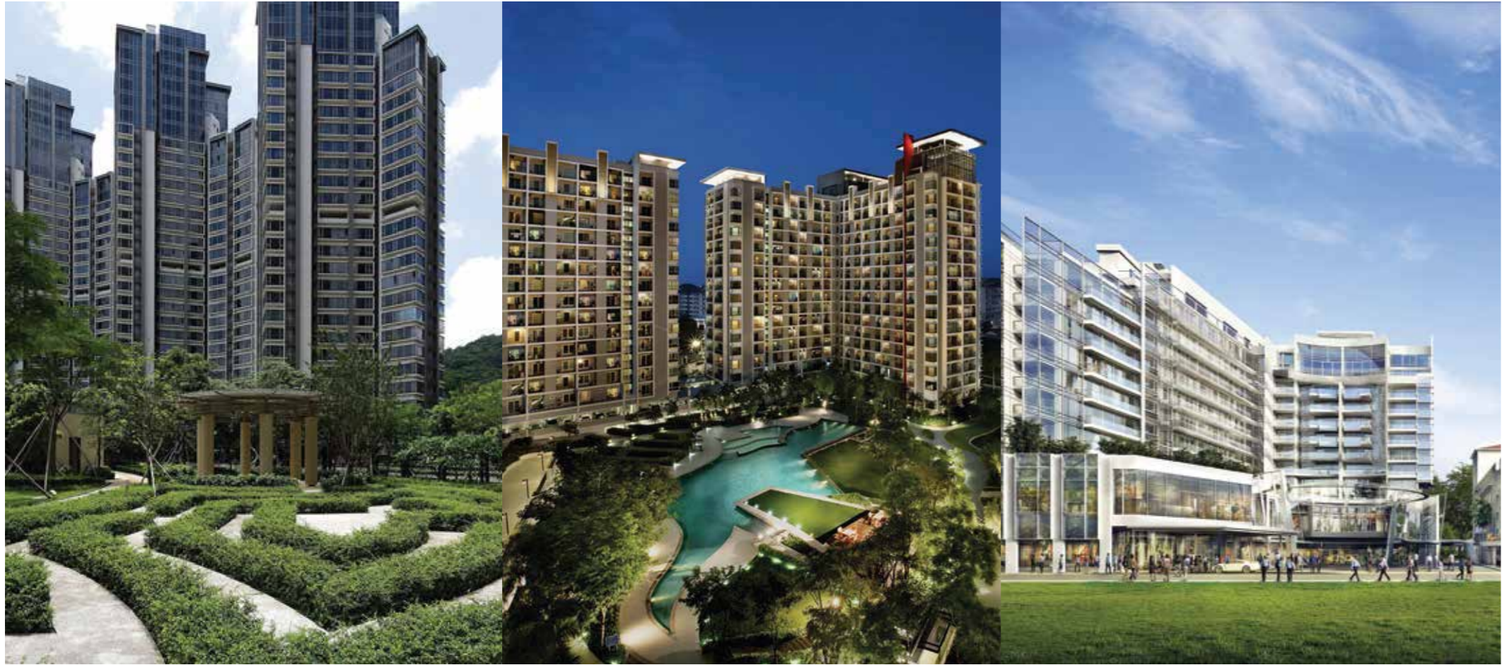
One Oasis, Macau